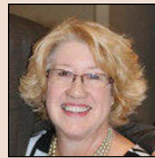
by Pam Crank